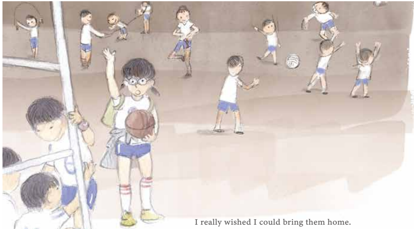
I really wished I could bring them home.