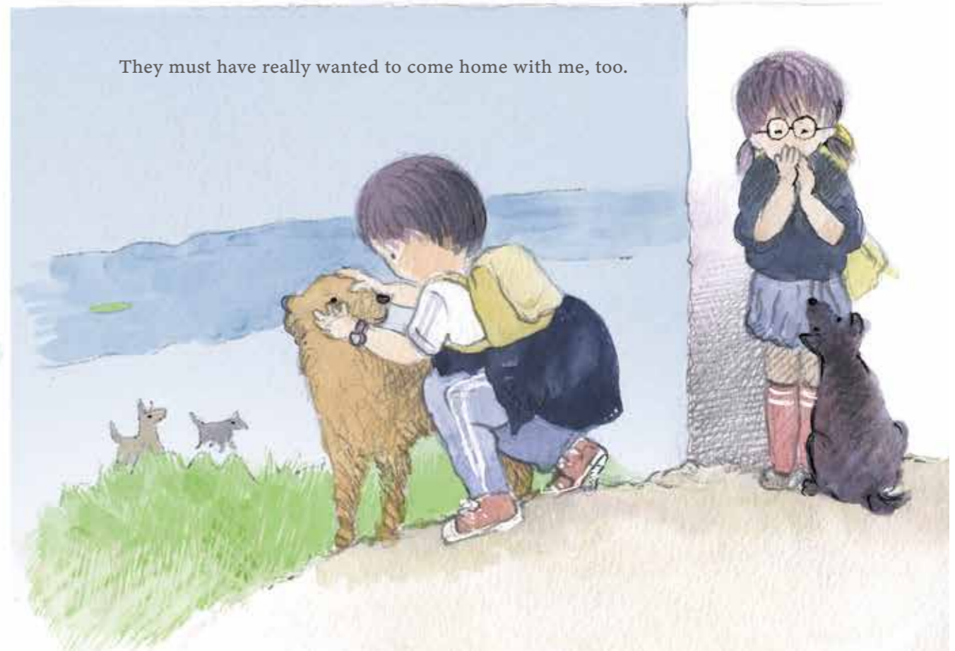
They must have really wanted to come home with me, too.